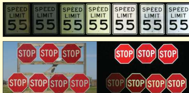
Sign weathering racks used to measure durability.

Revision number two of the 2003 Edition of the MUTCD introduces new language establishing minimum retroreflectivity levels that must be maintained for traffic signs. The new MUTCD language and changes are highlighted on the MUTCD web page: http://mutcd.fhwa.dot.gov/ .