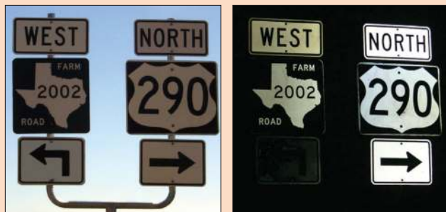
Retroreflective sheeting degrades over time. Daytime visual inspections cannot be used to assess retroreflectivity.

Nighttime visibility of traffic control devices is becoming increasingly important as our population ages. By the year 2020, about one-fifth of the U.S. population will be 65 years of age or older. In general, older individuals have declining vision and slower reaction times. Signs that are easier to see and read at night can help older drivers retain their freedom of mobility and remain independent.