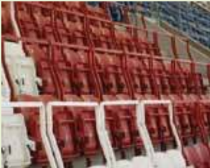
▲ Stadium seating in Bahrain.

It is essential that steel and aluminium in construction projects are resistant to corrosion; Plascoat® PPA 571 achieves this goal.