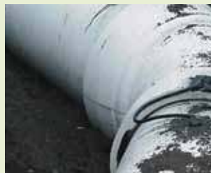
▼ Plascoat® PPA 571 after 5 years.