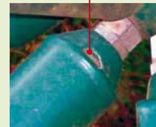
▼ No corrosion under the coating after 12 years