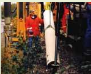
▼ Concrete reinforced piles in Scandinavia.