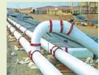
▼ Plascoat® PPA 571 lined pipes for desalination plants.

Plascoat® PPA 571 has a wide range of potable water approvals such as NSF/ANSI 61 and conforms to the requirements for FDA food contact.