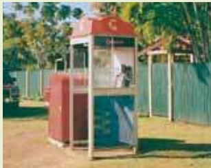
▲ Grill coated in Plascoat® PPA 571.