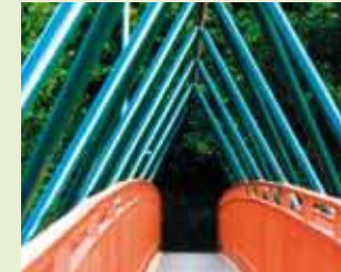
◀ Plascoat® PPA 571 in good condition after 20 years.

In the event of fire, the smoke generation from Plascoat® PPA 571 is both low and slow. In addition, the smoke is of extremely low toxicity. This makes Plascoat® PPA 571 often the coating of choice in tunnels and enclosed public buildings.