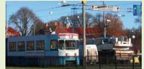
▲ Graffiti and fly-poster resistant lampposts in Sweden.

Lampposts in particular need extra protection at ground level where dogs frequently contaminate the environment. Trials at the Swedish Corrosion Institute have proved that thermoplastic coatings such as Plascoat® PPA 571 are one of only three out of 52 corrosion protection systems that can extend the life of a lamppost by up to 50 years.