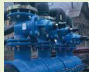
▼ Coated water fittings in the Arctic.