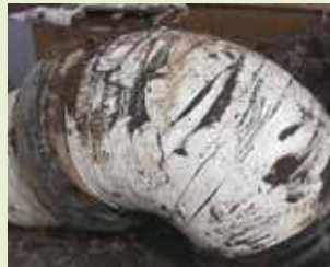
▲ Ductile iron pipe with deteriorated PVC tape wrap after 5 years.