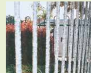
▲ Aluminium fencing coated in green polyester after just 18 months by the sea in Brisbane, Australia.

Live tests in the US have shown that the salt spray corrosion rate and the abrasion rate of Plascoat® PPA 571 are half those of standard coatings and the fading rate is 1/20th.