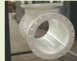
▲ PPA 571 coatings on slurry and sewage pumps and fittings.