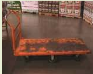
▲ Storage cart coated in liquid paint after 18 months' use.