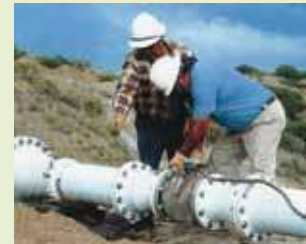
▲ Plascoat® PPA 571 withstands UV, sulphuric acid, chlorides and slurries for a ferric cure line in Arizona.