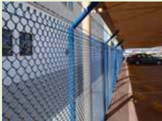
▲ Successful 15-year field test in Dubai.

The abrasion rate of Plascoat® PPA 571 is half that of standard coatings and the fading rate is 1/20th.