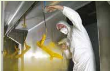
▲ A 1mm plate coated in Plascoat® PPA 571 and polyester after an impact of up to 12 Joules.

Given the correct procedures, Plascoat® PPA 571 can be over-sprayed with polyester powder to provide an exceptional coating, offering: