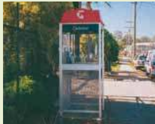
▲ Grill coated in polyester.

Bus shelters, cycle racks, benches, waste bins, road culverts, balustrading and many other items of street furniture have benefited from Plascoat® PPA 571, which has consistently out-performed traditional coatings in these applications.