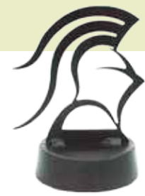
WATERJET CUT ALUMINUM