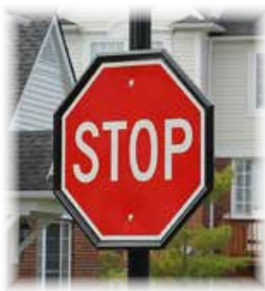
Extruded Frame Front View