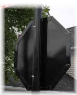
Extruded Frame Back View